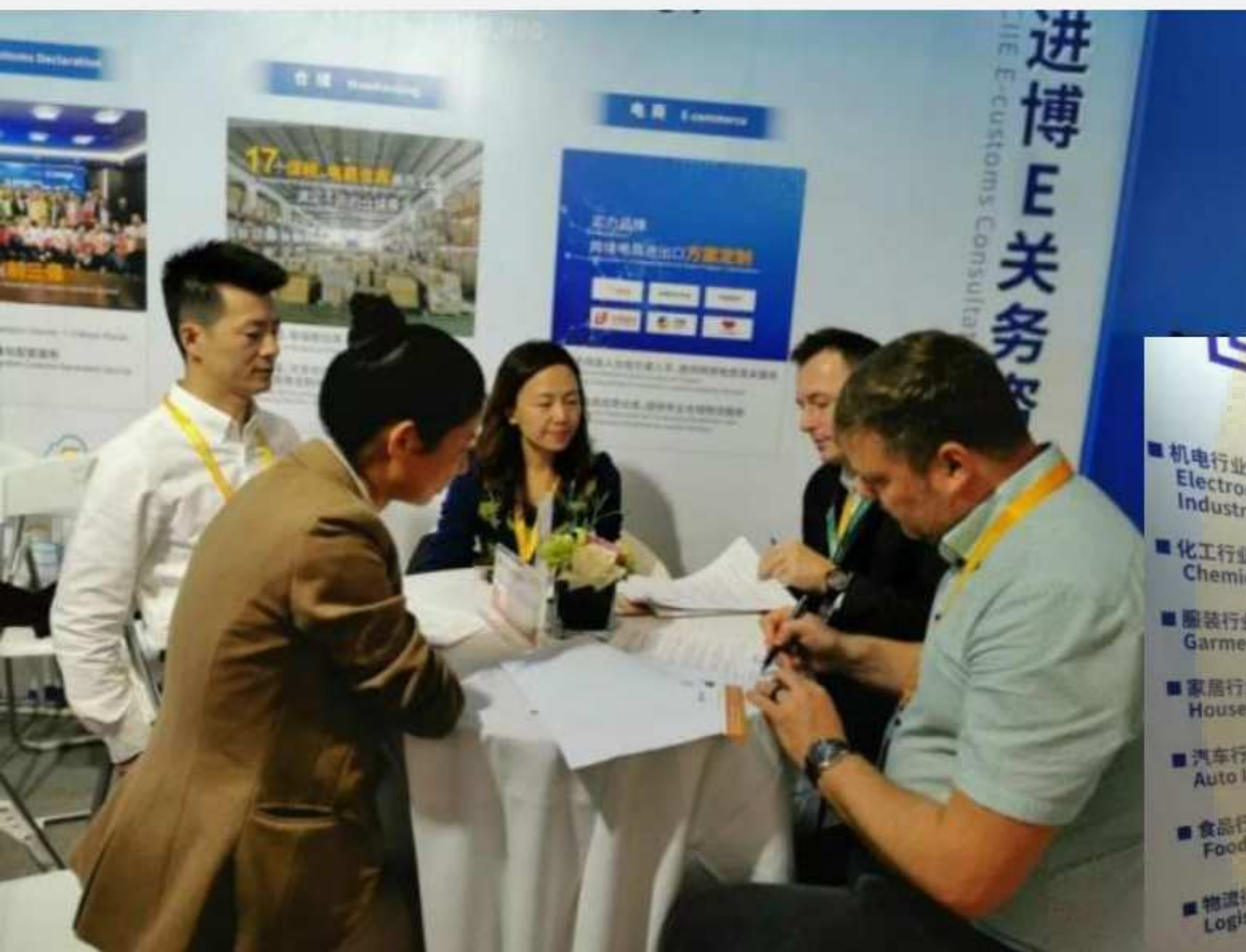
Signing a contract with Croatia's 70-year freight forwarder

In this CIIE, Xinhai is very glad to be the only enterprise participating in the exhibition in the customs declaration industry. In the whole six days, Xinhai had more and closer business communication and communicate with representatives of enterprises gathered in all parts of the world, and has worked with new and old friends at home and abroad to seek the smooth development and expansion of import and export business.