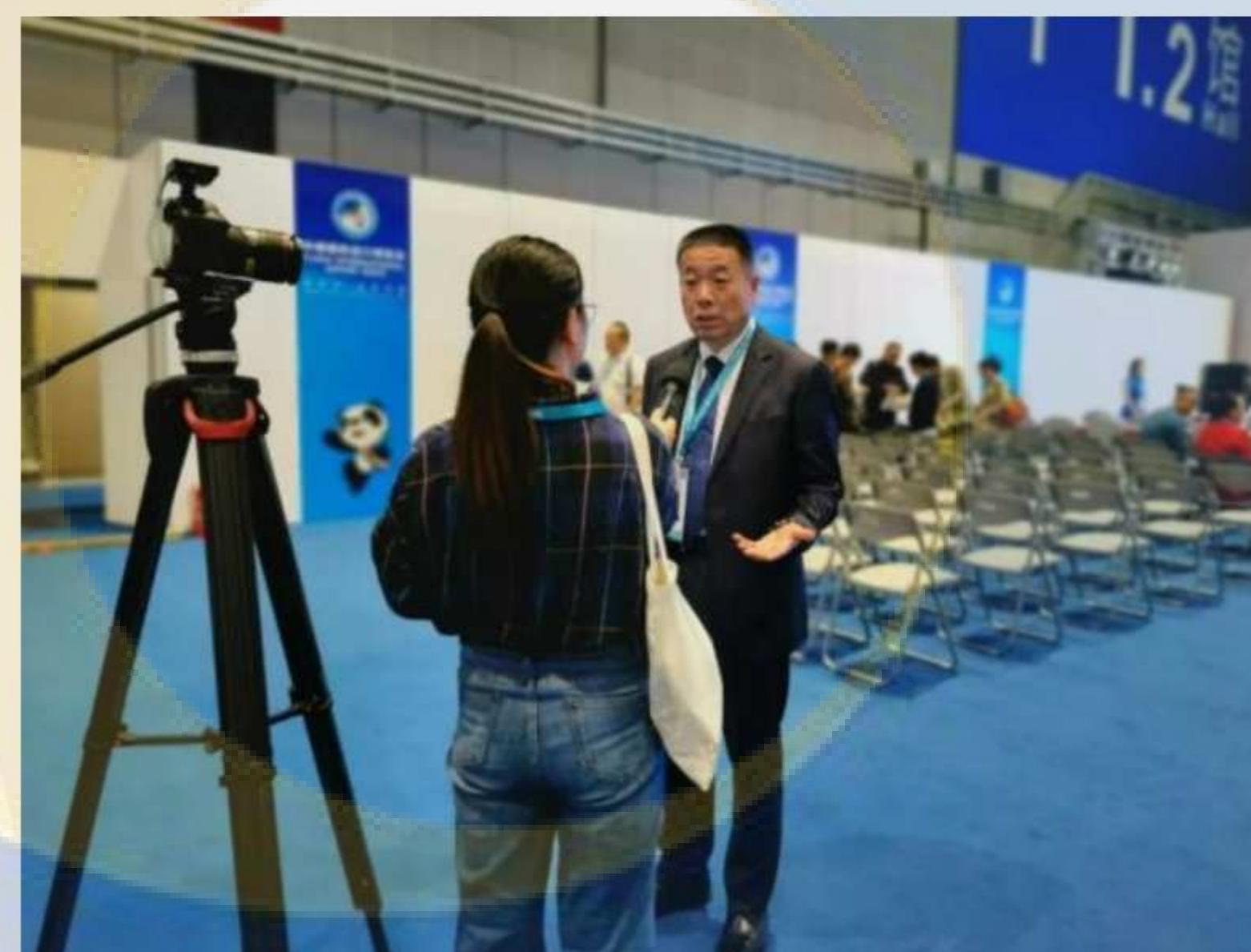
Chairman of Oujian group accepts shanghai TV interview