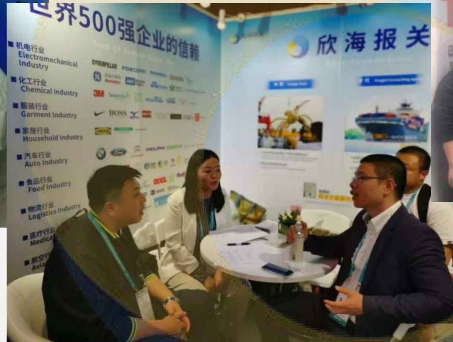
Communication with domestic exhibition enterprises