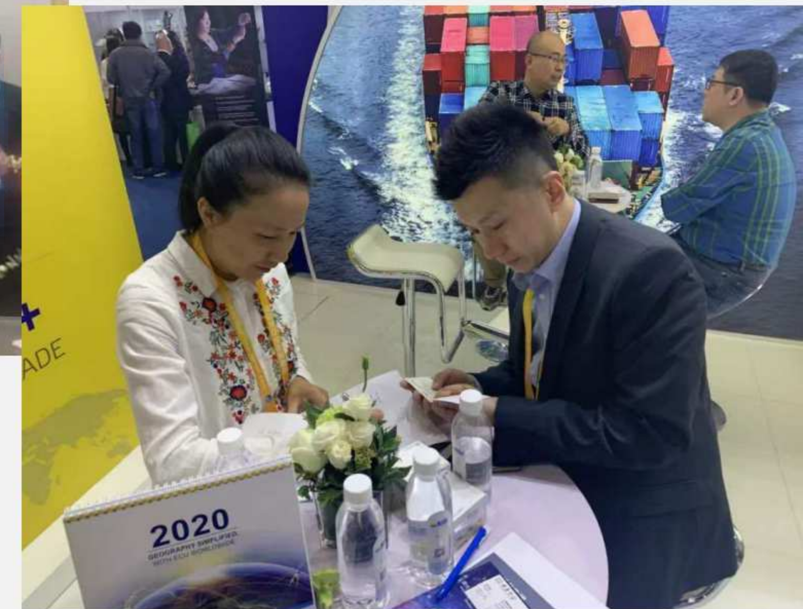
Communication and on-site business guidance with domestic exhibitors