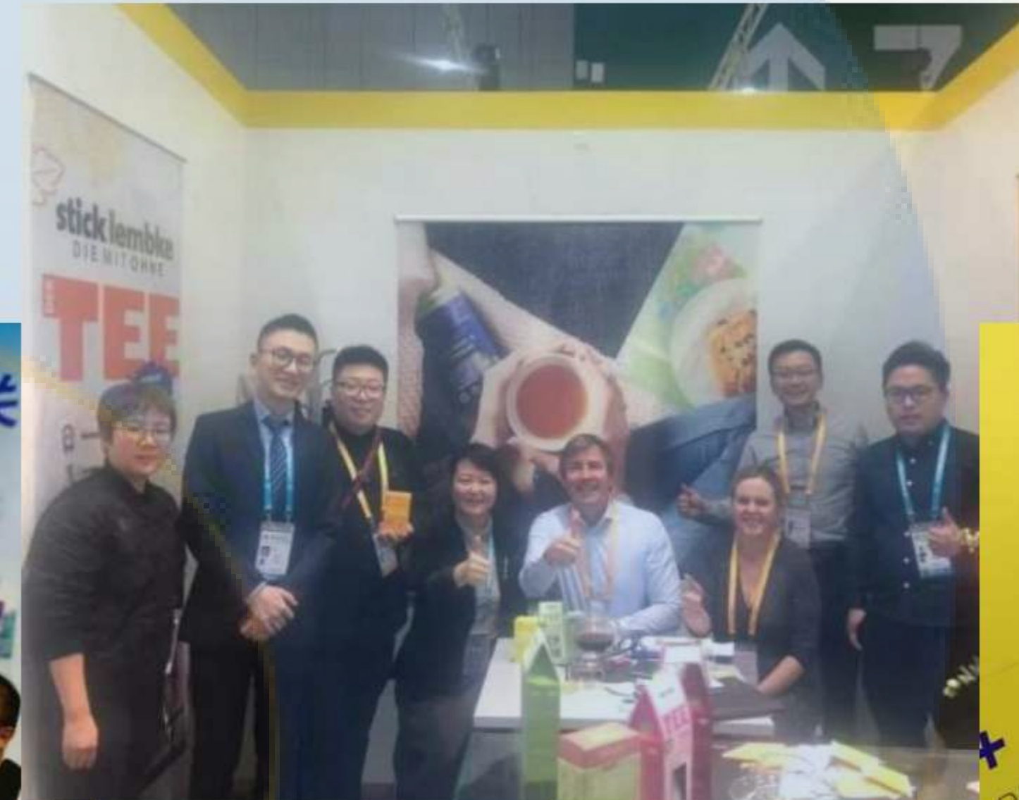
Communication with foreign exhibitors