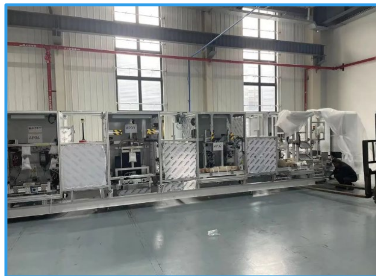
上海设备仓库内部照片 Interior photos of Shanghai Equipment Warehouse

Ougao International Logistics Division has recently undertaken overseas engineering logistics projects, from German factories to domestic factories, including booking, packaging, shipping, customs clearance, distribution, disassembly, installation and other full-process international supply chain projects, and successfully completed the import of heavy cargo International supply chain one-stop service.